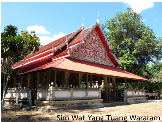
Sim Wat Yang Tuang Wararam