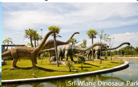
Sri Wiang Dinosaur Park