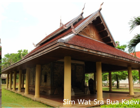
Sim Wat Sra Bua Kaew