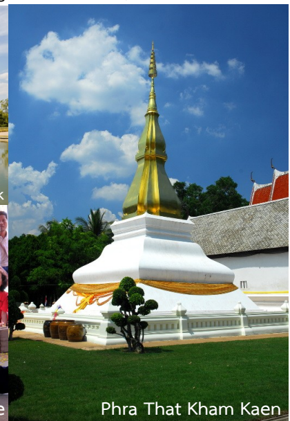
Phra That Kham Kaen