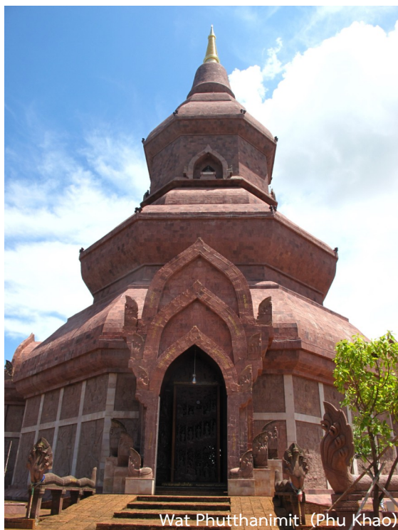
Wat Phutthanimit (Phu Khao)