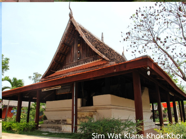
Sim Wat Klang Khok Khor