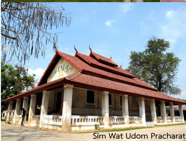
Sim Wat Udom Pracharat