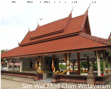
Sim Wat Mud Chim Wittayaram