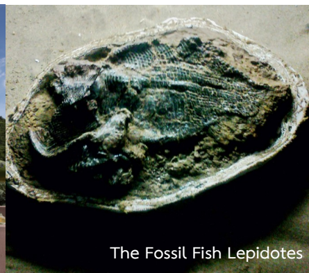
The Fossil Fish Lepidotes