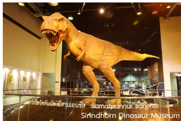
Slamohyrannus isanensis Sirindhorn Dinosaur Museum