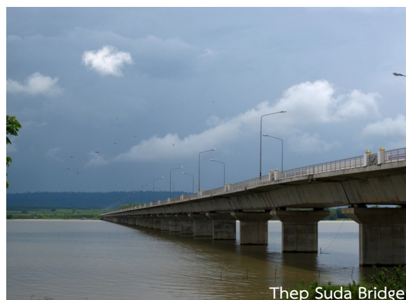
Thep Suda Bridge