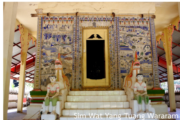
Sim Wat Yang Tuang Wararam