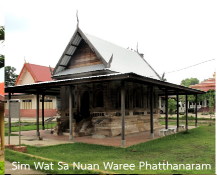
Sim Wat Sa Nuan Waree Phatthanaram