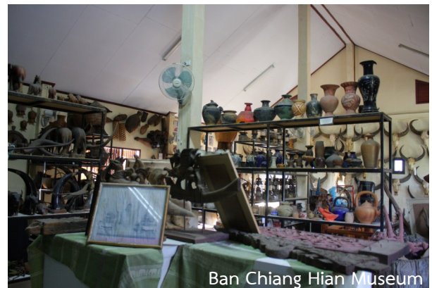
Ban Chiang Hian Museum