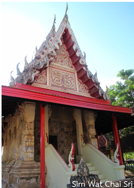
Sim Wat Chai Sri