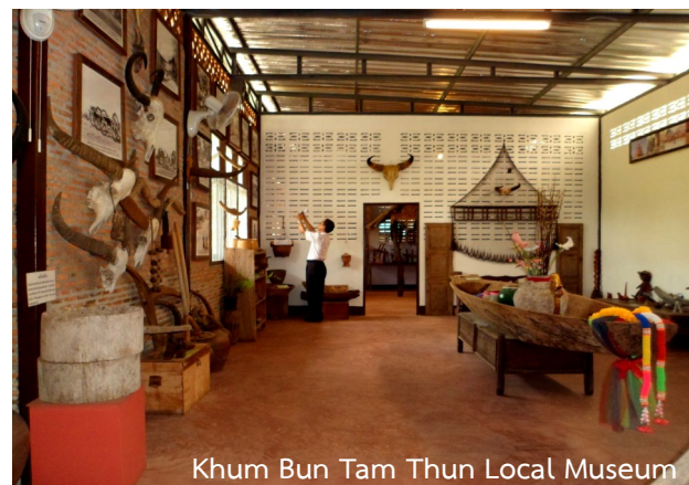
Khum Bun Tam Thun Local Museum