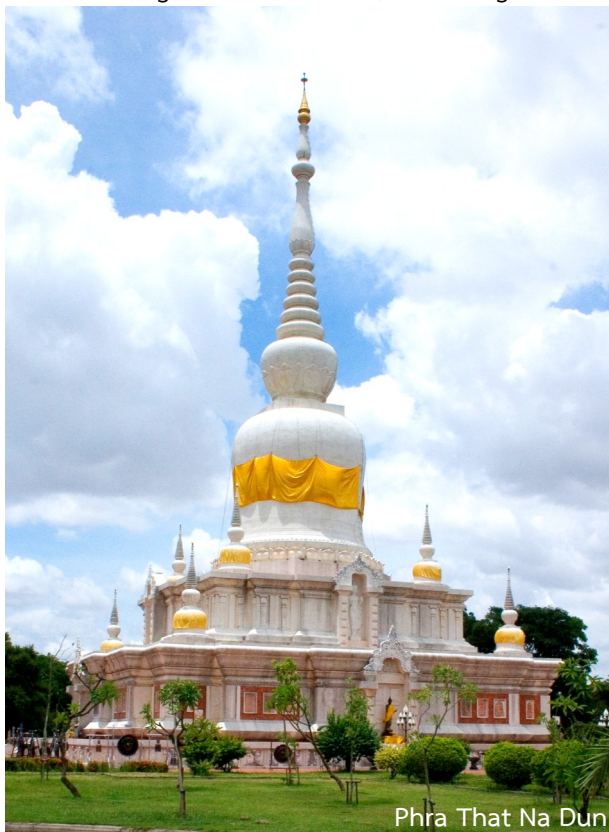
Phra That Na Dun