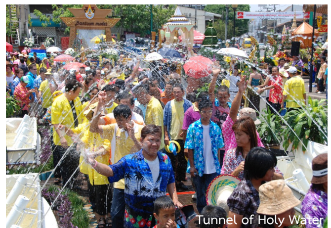
Tunnel of Holy Water