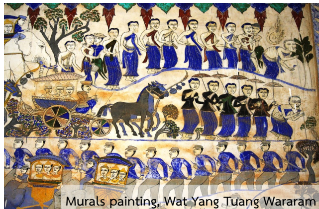
Murals painting, Wat Yang Tuang Wararam