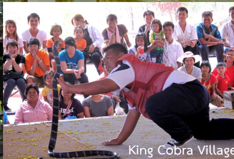
King Cobra Village