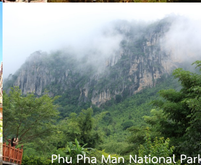
Phu Pha Man National Park