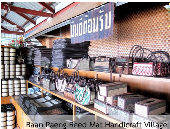
Baan Paeng Reed Mat Handicraft Village