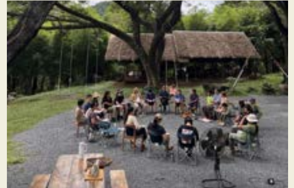
Training before starting activities Learn basic knowledge about the activities Overall camp overview