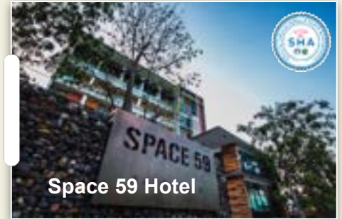
Space 59 Hotel