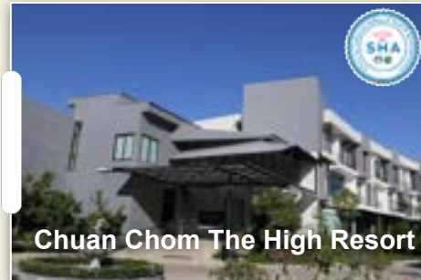
Chuan Chom The High Resort