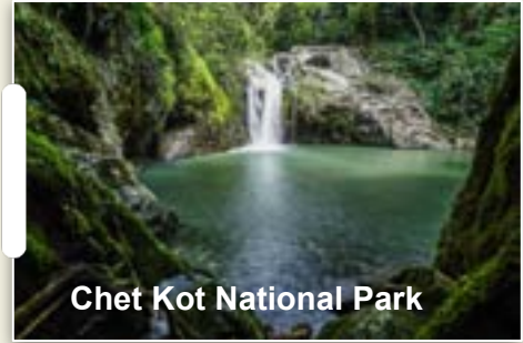
Chet Kot National Park