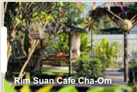
Rim Suan Cafe Cha-Om