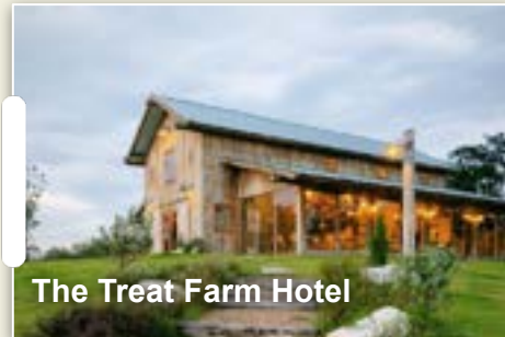
The Treat Farm Hotel