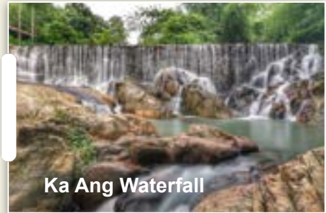
Ka Ang Waterfall