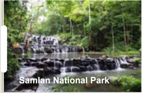
Samlan National Park