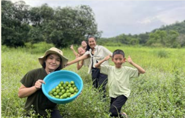
Preparing to cook in the midst of nature Preparing ingredients for cooking in the forest Experience Learning life skills in nature