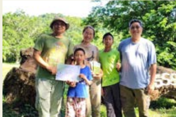
Receive a certificate from the camp