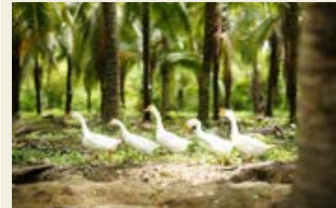
Atmosphere Inside the Garden Images of the atmosphere within the garden of Aromatic Farm